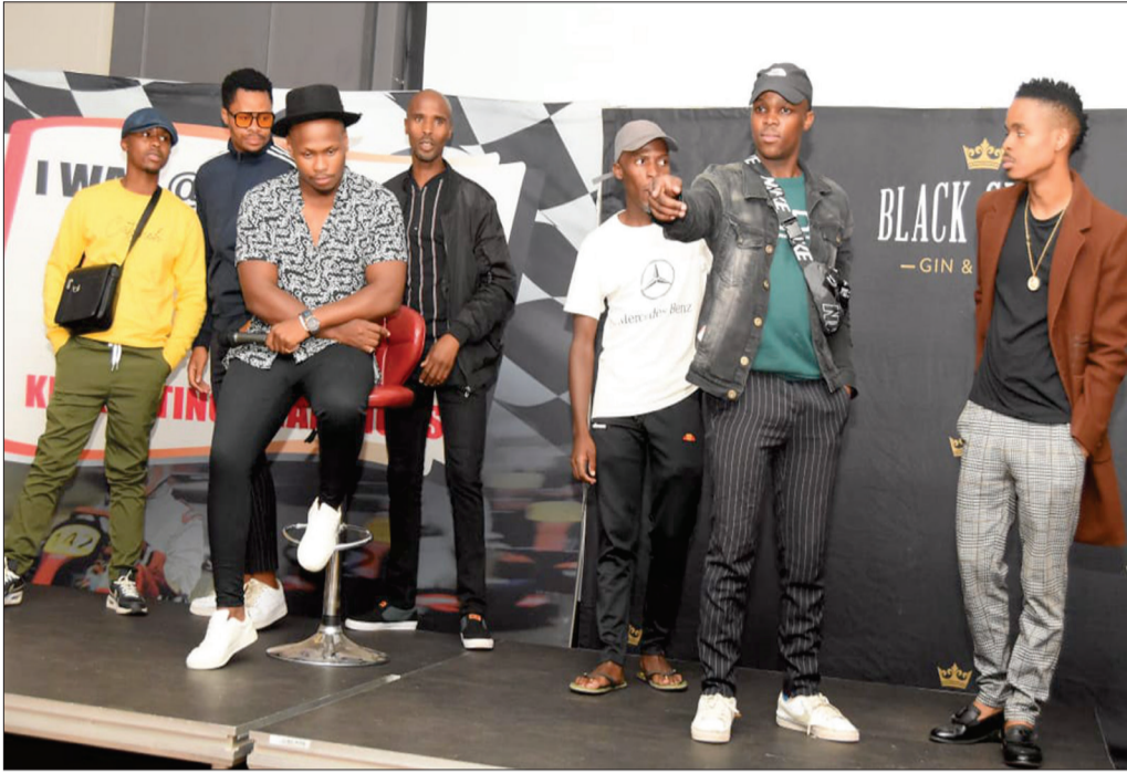
Some of the comedians who kept attendees in stitches at the Mad Funny Comedian at Mayfair Casino in Mthatha