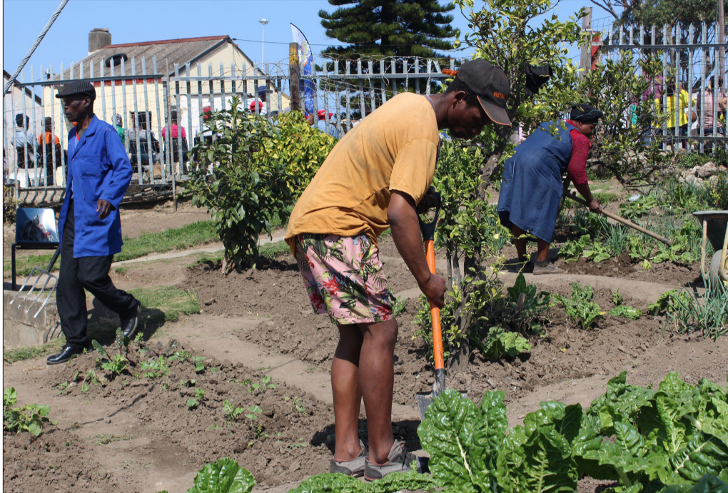
Members of Siyakholwa Development Foundation working in a garden, the vegetables are helping to feed young children in the Early Child Development

S iyakholwa Development Foundation has brought a smile in many communities around Mthatha and provided various value-added projects to uplift the Mthatha community. The foundation cultivates food gardens to feed young children in the Early Childhood Development (ECDs) to alleviate challenges of stunted growth and malnutrition. At care centres where there are no cooking facilities, fresh vegetables are shared with parents to prepare at home for their young children.