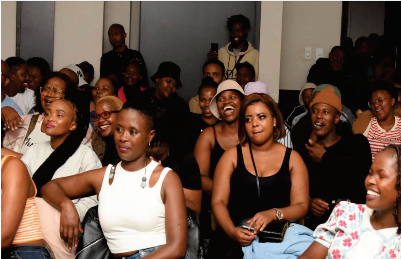
Attendees laughed until the Mad in Funny comedian show ended at Mayfair Casino. The show was hosted by Ciera.