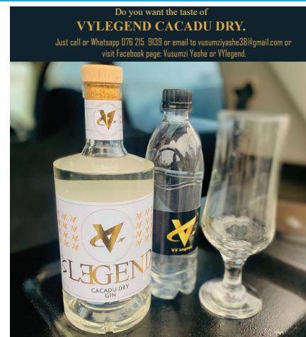
Not for persons under the age of 18.

Office No.1, Grencoombe, Unit 5, Leeds Road, Mthatha, 5100 Contact Number: 063 834 3192, Central Database No: MAAA1017199