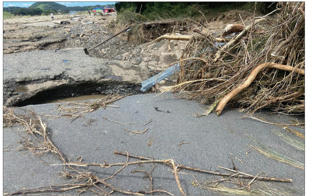
Havoc caused by the recent pouring of rain has caused a miserable life across the province of the Eastern Cape

The OR Tambo District Municipality Executive Mayor Councillor Mesuli Ngqondwana has assured the victims that the district municipality is committed to support the victims of the floods. He described the situation in Coffee Bay as a very devastating situation that requires all sectors to join hands in order to ensure that the livelihood of those affected is restored.